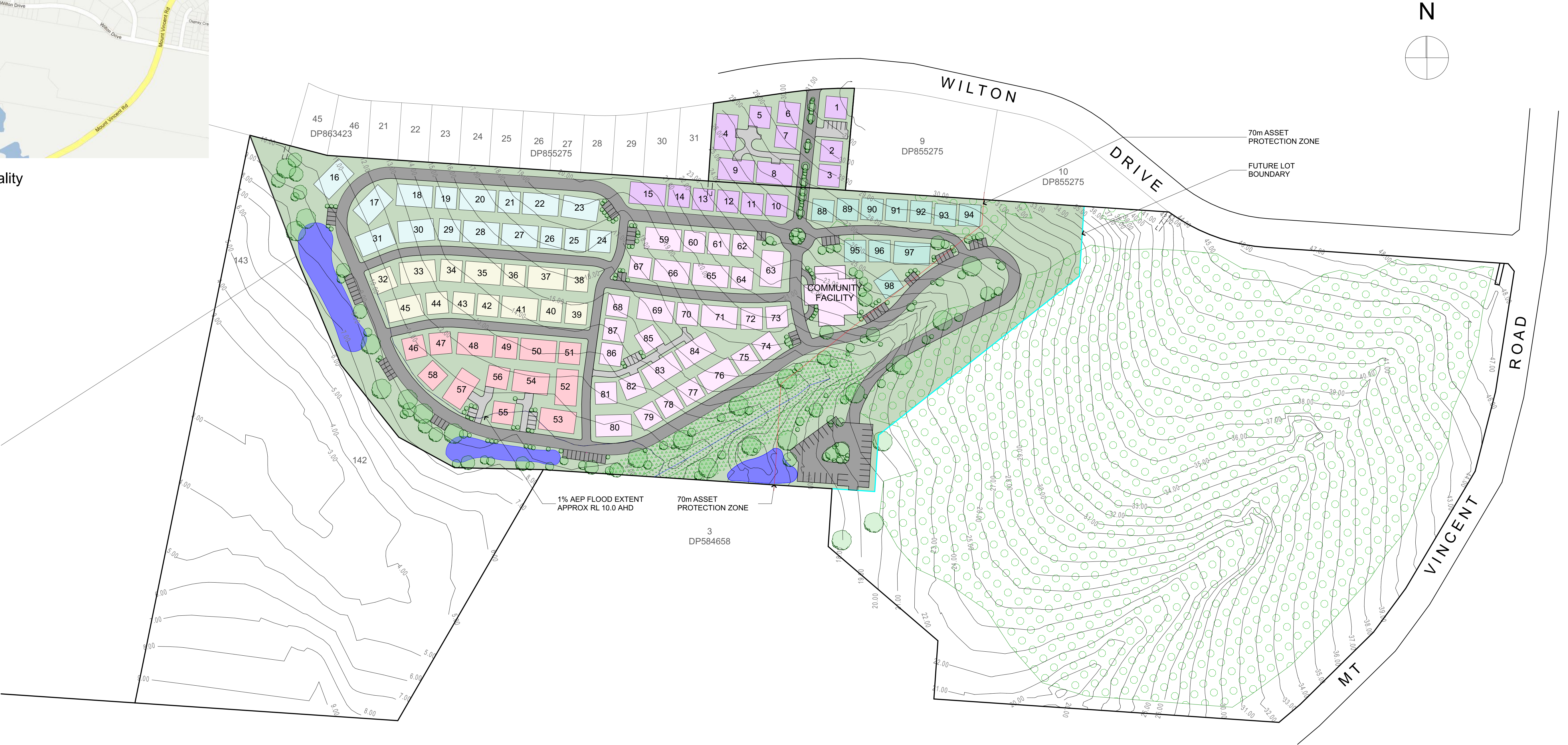
Site Plan 1:1500